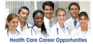
Health Care Career Opportunities

Come explore the wonderfully exciting world of healthcare.